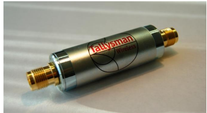
TW125 Dimensions (mm)

Its low loading allows for both the antenna and the TW125 in-line amplifier to be powered by the GNSS receiver. The TW125 passes DC supply to the antenna, therefore not requiring additional hardware such as bias-T, power cable and power supply.