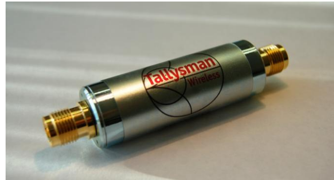
TW126 Dimensions (mm)

The TW126 passes DC supply from input to output to support centre conductor DC supply to the antenna, therefore not requiring an additional Bias source and a bias-T.